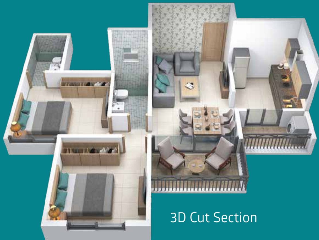
3D Cut Section