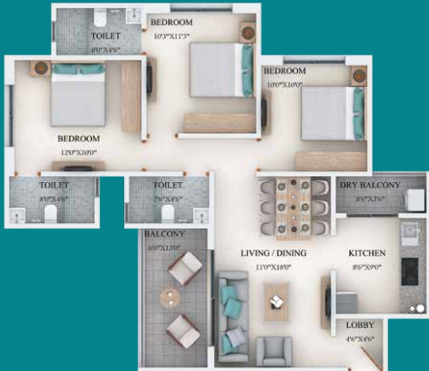
2D Rendered Plan