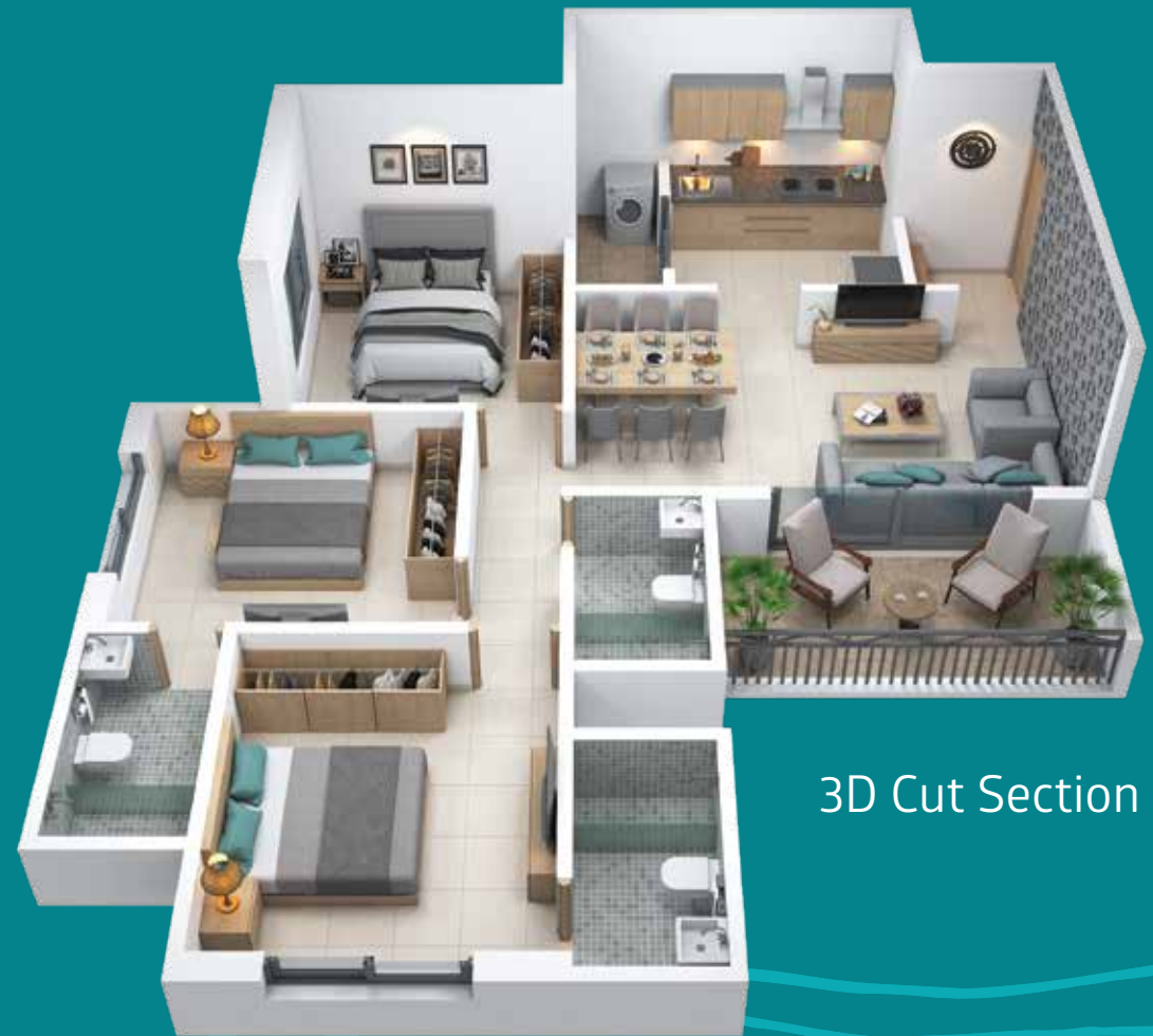
3D Cut Section