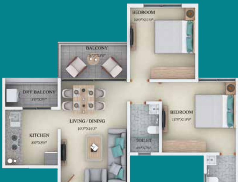
2D Rendered Plan